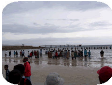
77 baptisms on the Sunday before the Rally