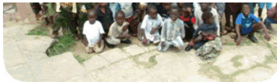
Some of the saints at Solwezi