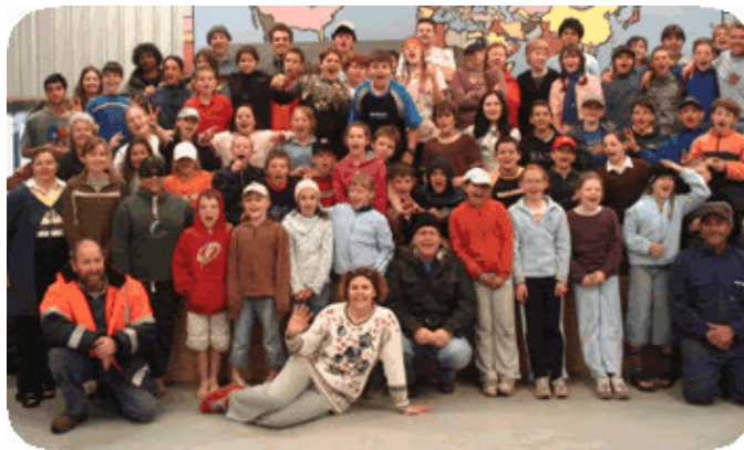
About 60 children gathered for the popular Next Generation Camp

On the topic of camps, the Perth assembly held its Next Generation Camp (for Western Australian assemblies' children from 8 to 13 years old) at the end of September at their camping ground at Beverley. This was a great time of learning, fun and fellowship. This was followed immediately by their full Spring Camp.