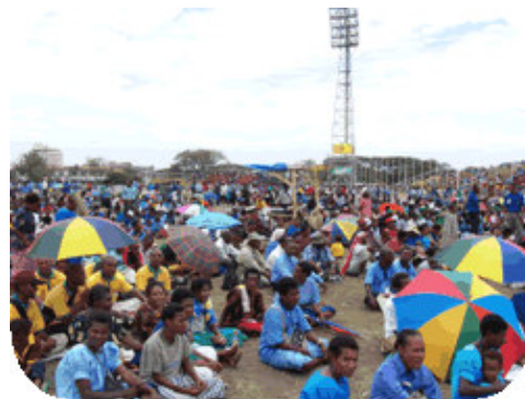
Part of the crowd at the rally