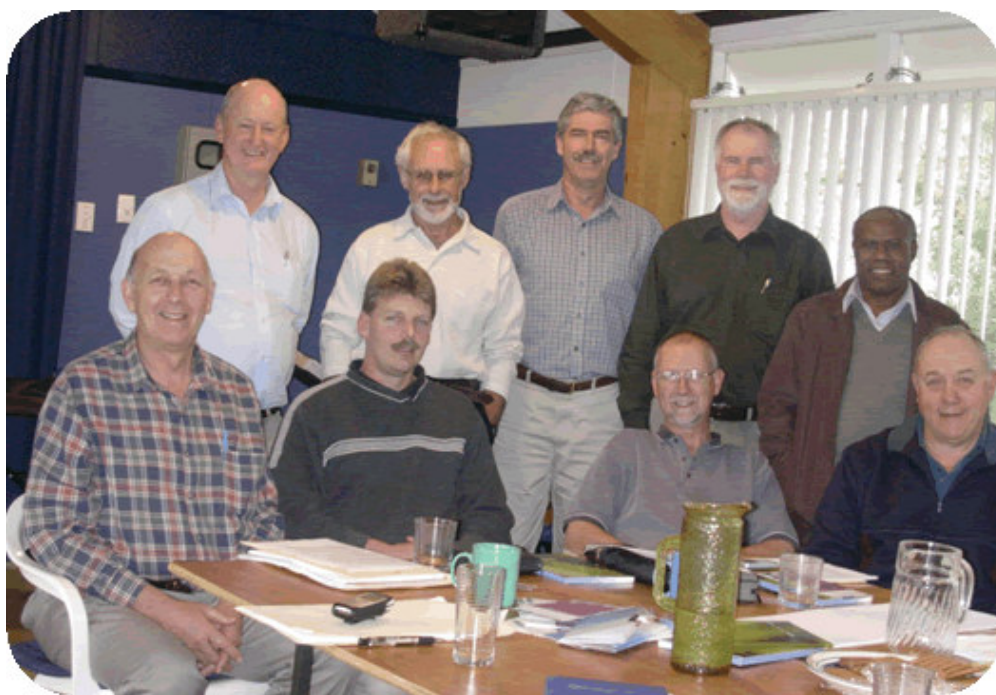
A Council Meeting with New Zealand Pastors

There are several other places where revival is breaking out. We've listed some of them in the World News section at the end of this edition. Please pray for them. They are your brothers and sisters in Christ and covet your prayers.