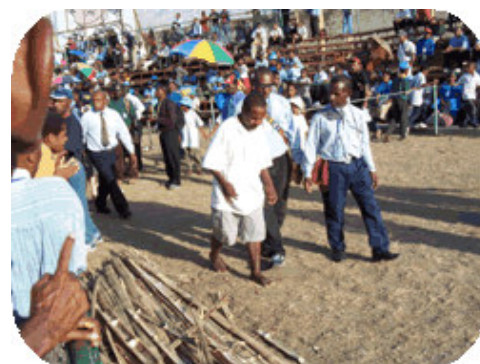
Crippled man walks