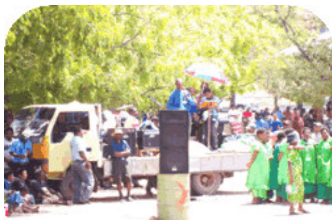
Outreach truck in full swing

The latest count? As of the end of that week there were almost 900 folk baptized! Praise the Lord.