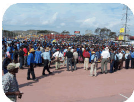
A large altar call