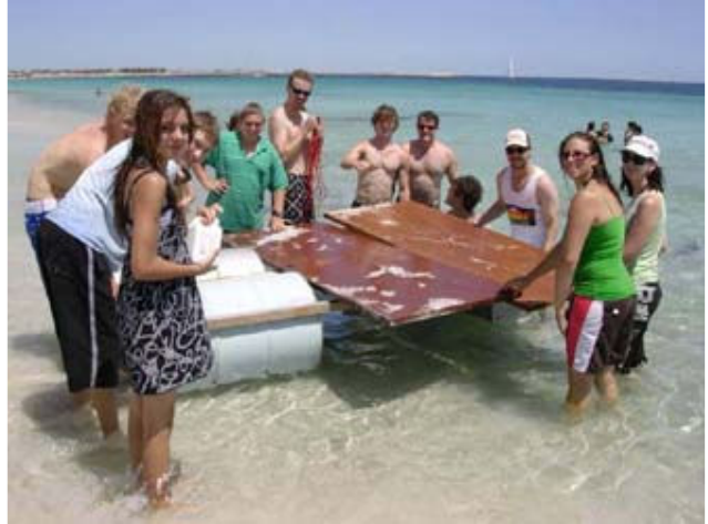
Perth, Western Australia