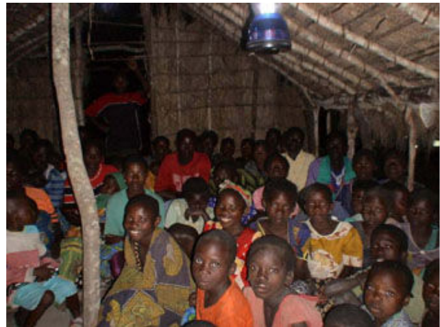
Folk at a meeting in Njilamtambo