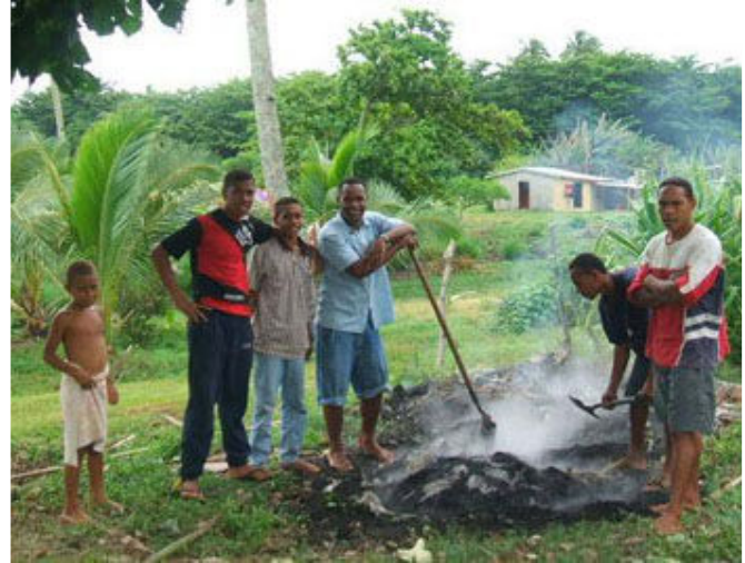
Recent 21st birthday celebrations