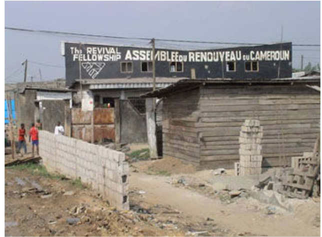
The new banner boldly advertising our presence on the side of the house-hall.