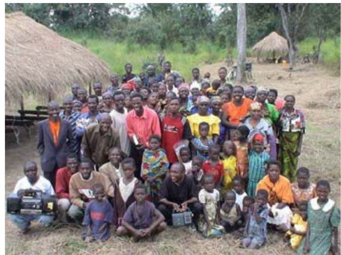
The saints at Lumwana West