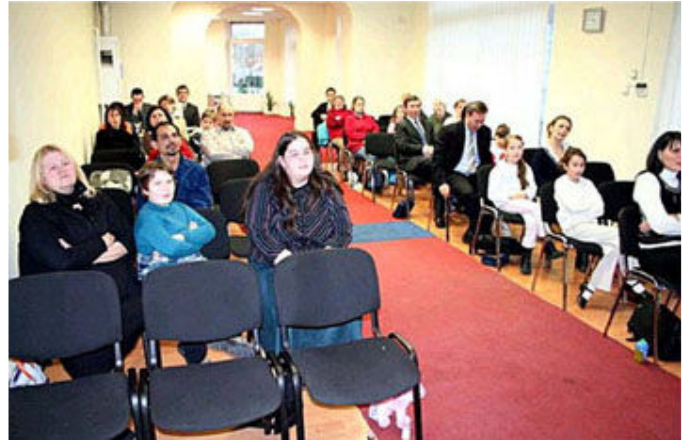
First Meeting in the New Hall