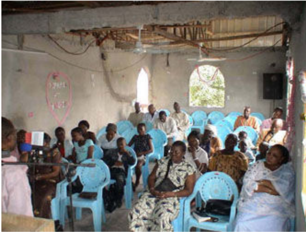
The first Sunday meeting in the new hall; still under construction.