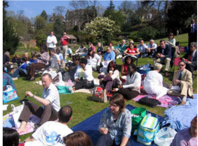
Picnic in the English Spring weather