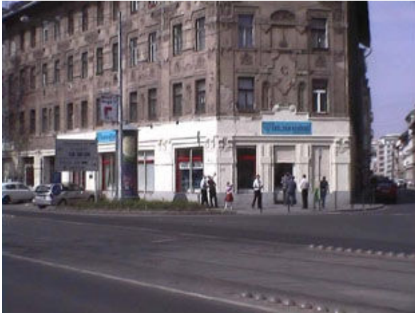
Brethren in front of the new hall