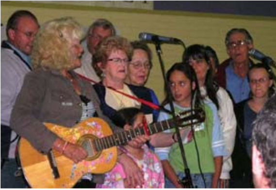
Port Macquarie, Australia