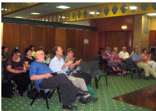
Gympie meeting in progress