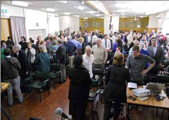
Saints chatting after one of the meetings