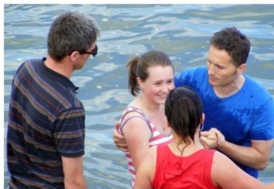
One of the baptisms