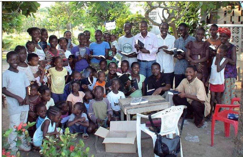
The Liberian brethren proudly holding their new Bibles