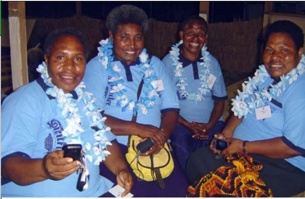
PNG sisters visiting Vanuatu for the rally