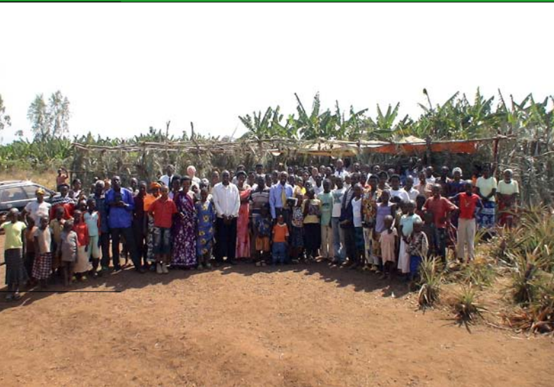
Mutenderi assembly as they were in August last year