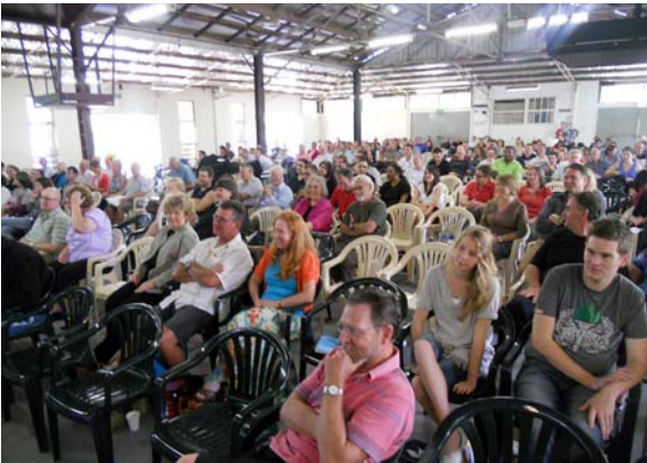
The attendants at the Leadership Camp taking it all in