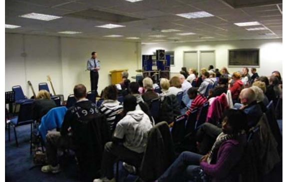
The first Saturday night event in North London's new hall