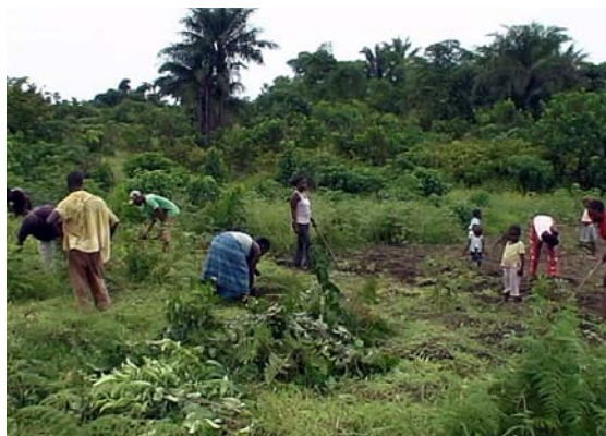
The saints weeding the cassava plants