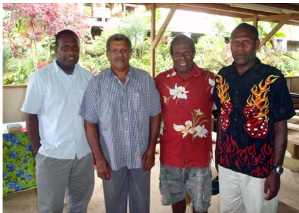
The local Ni Van pastors in Vanuatu