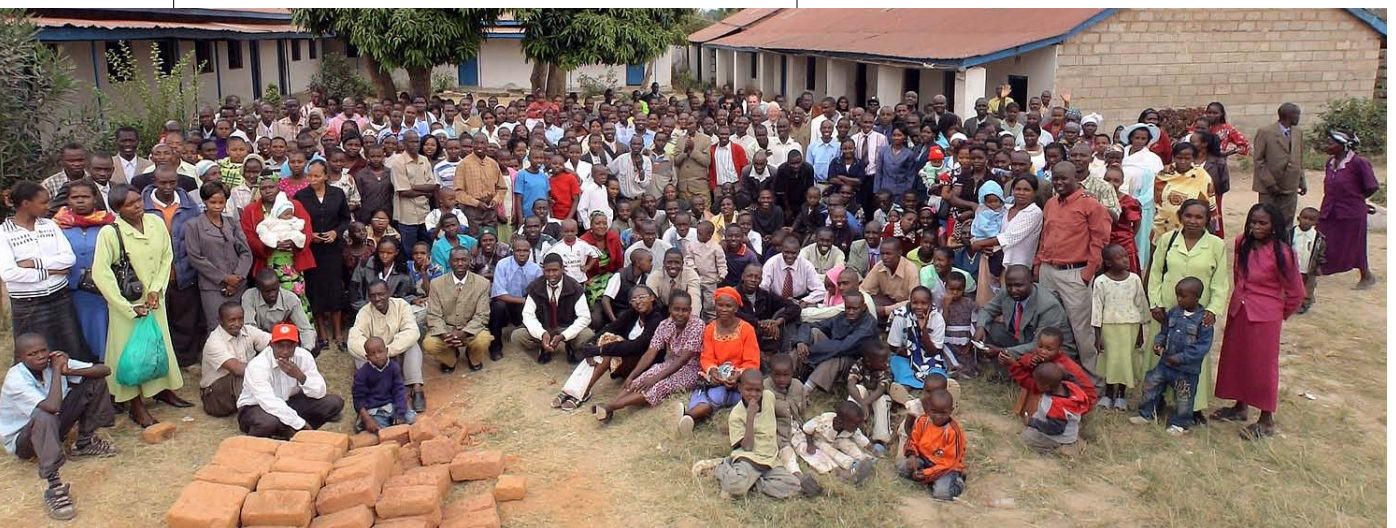
Kenya Rally Sunday after the meeting

At the pastors' meetings before and after the rally a lot of emphasis was placed on organising ourselves to be more effective in the Lord's work, becoming self sufficient, and taking responsibility for revival in Africa. The theme of this year's rally was "Walk the Talk" and a lot of good ministry was heard from both the Kenyan pastors and the visiting leaders."