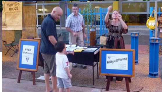
Some of the outreaching in Darwin