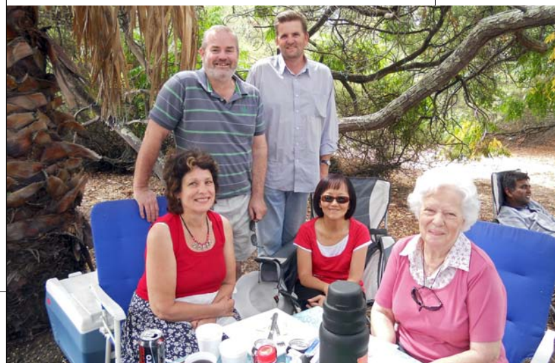
A picnic at the new W.A. campsite—it’s looking pretty relaxing already