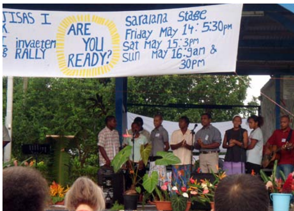
Santo group on stage