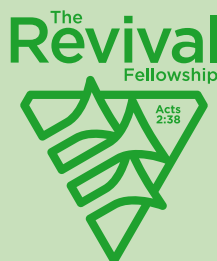
North Queensland Rally meeting