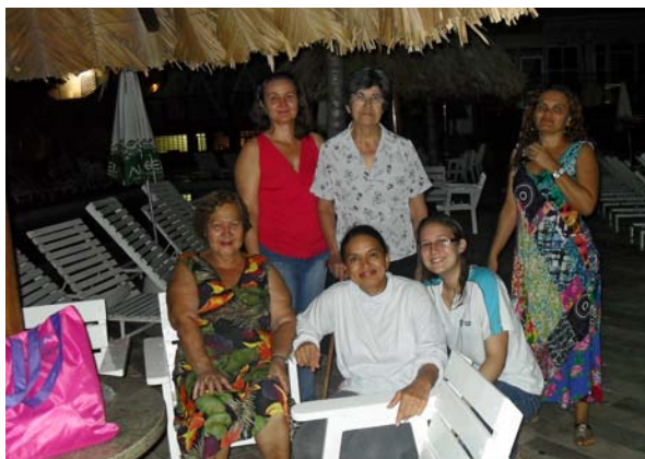
Happy members of the Goiania fellowship