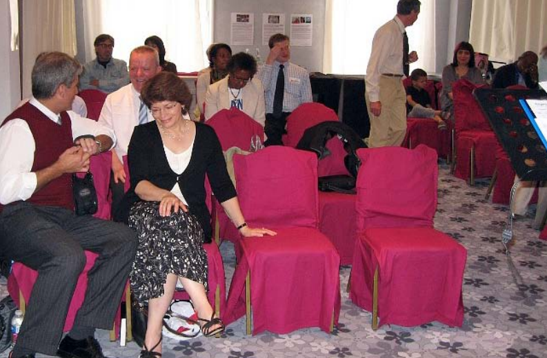
Sunday meeting at the "Hotel de France"