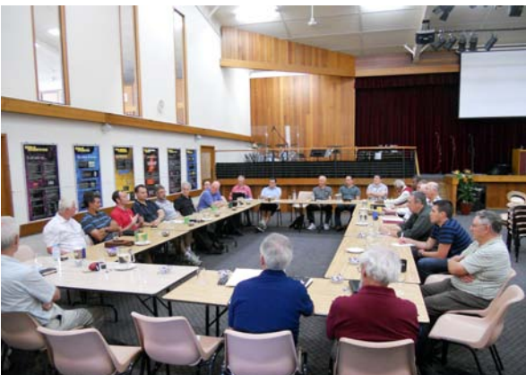
Queensland Pastors' Meeting just prior to the Camp Morning tea (right)