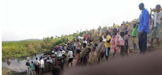
Onlookers at a baptism at Mutenderi