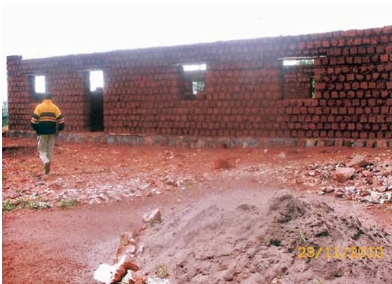
The new Mutenderi hall under construction