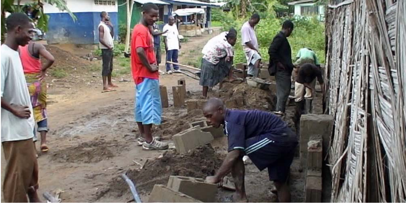
Liberian saints building the new hall