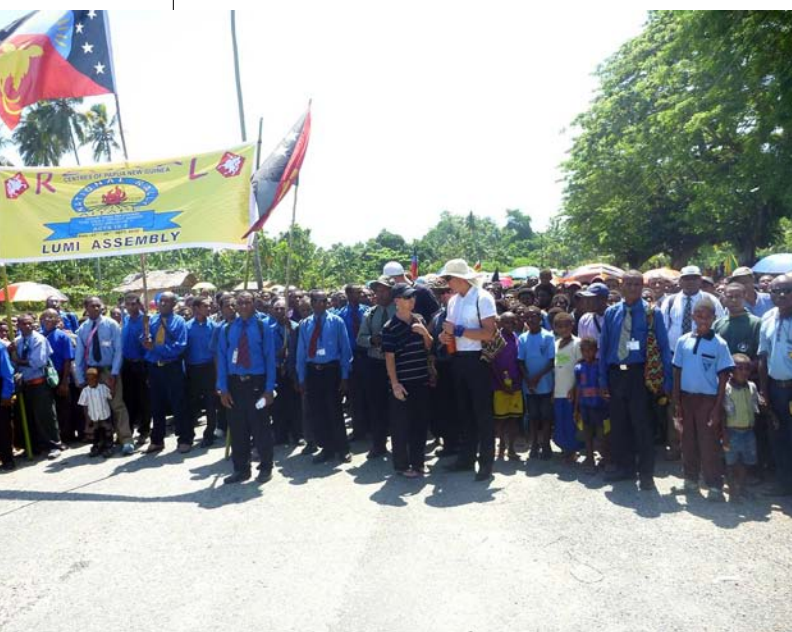
Lumi Assembly representatives arrive