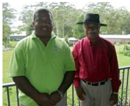
Visiting pastors from Fiji

The point was made early that the camp wasn't just for "leader types" but was designed so that all may be strengthened in their appreciation of our unique Fellowship, and how they might further serve the Lord. It was great fellowship with two days jam-packed with information and guidance for those wanting to be more involved in whatever capacity. The programme included a variety of Bible studies, slideshows and workshops. We pray we can look back at some point in the future and point to this camp as the beginning of many saints' deeper involvement, or even ministry, in the Church. Jesus told us we are here to serve.