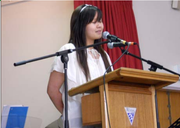
There were some wonderful testimonies over the weekend