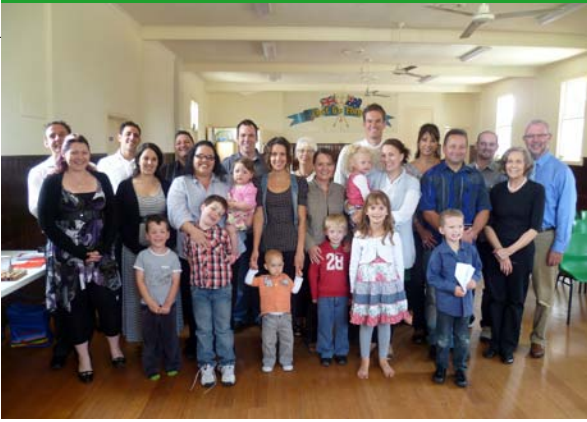
The fledgling Geelong fellowship at the end of February