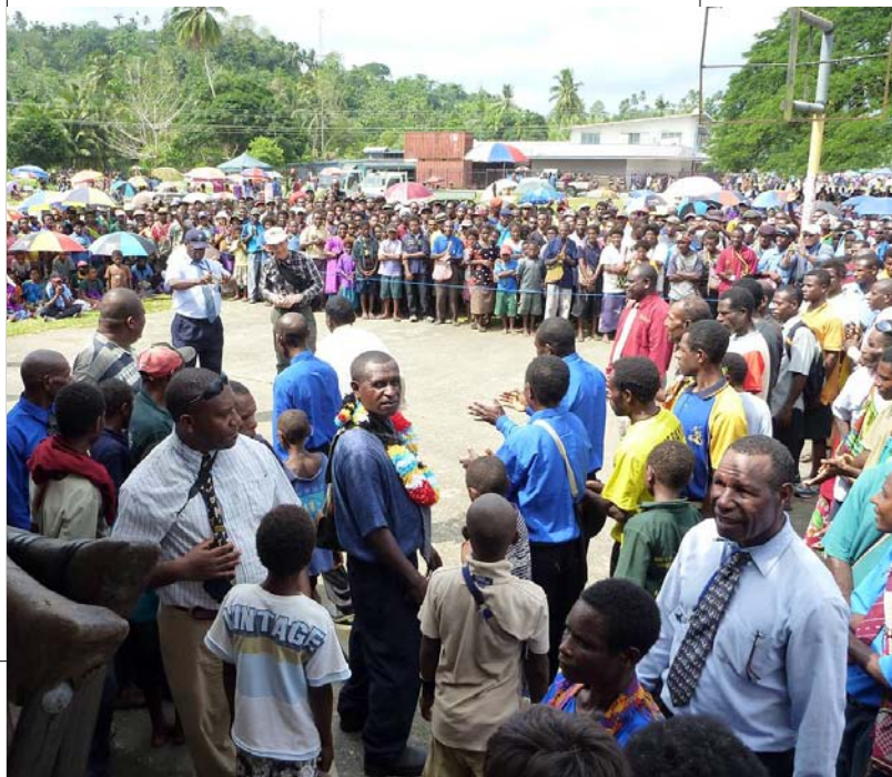
Part of the crowd at the PNG Rally