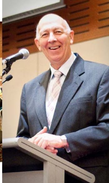
The Chairman in Perth

by 15,000 passers-by each day. We had enquiries from both.”