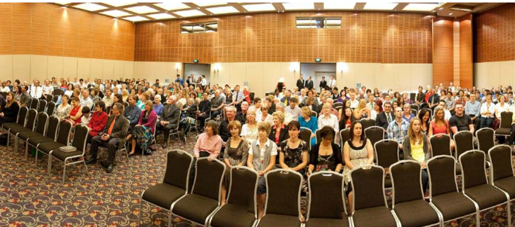
Composite view of one of the Western Australian Rally meetings