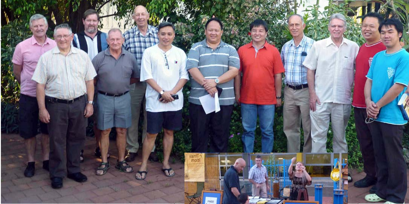
Assembled pastors at the South East Asian Regional Rally