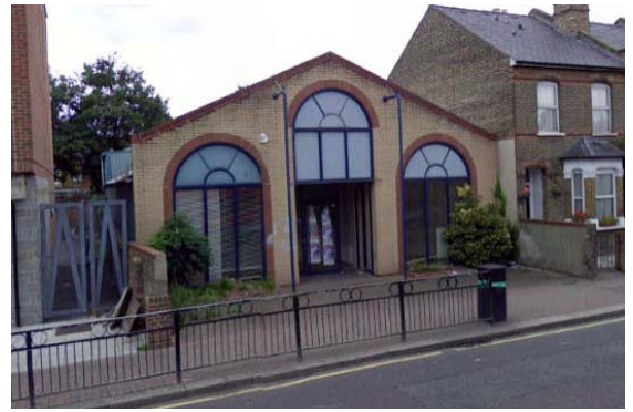
Outside of the West London hall