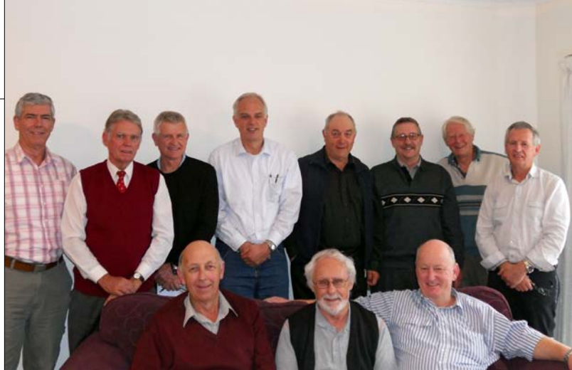
The Council and Liaison Pastors’ Meeting

Small assemblies appreciate extra ministry and there are quite a few assemblies providing au-