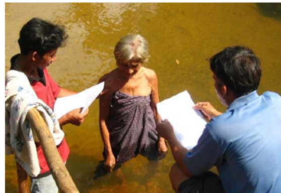
Baptism in Thailand