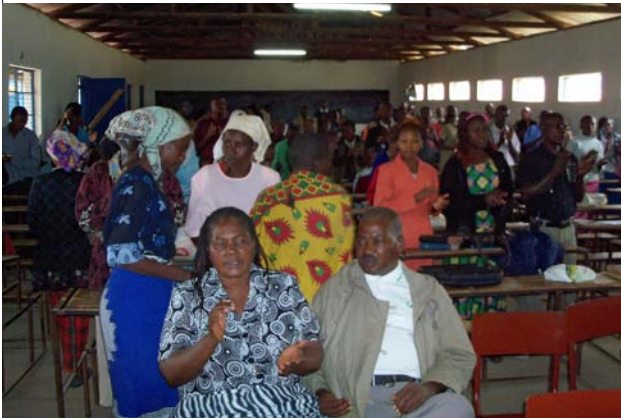
Kenya Rally meeting in progress