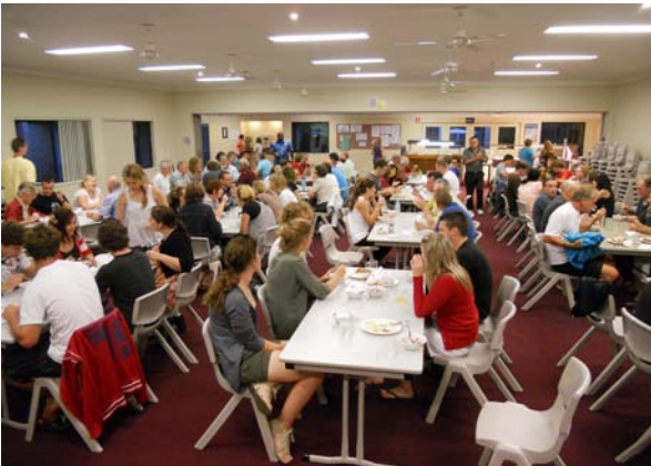
Fellowship over breakfast