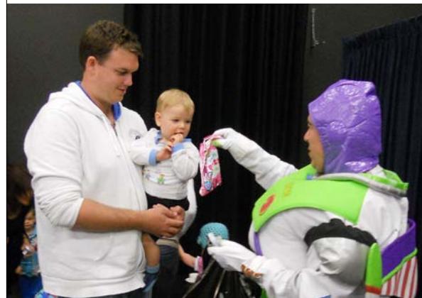
New Year’s Eve fun