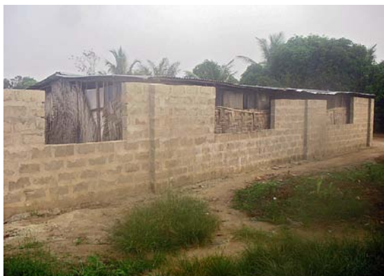
The walls completed up to the roof

On a final note the Revival continues, and along with it, the need for more Bibles. One of the welcome donations recently were new Bibles; as you