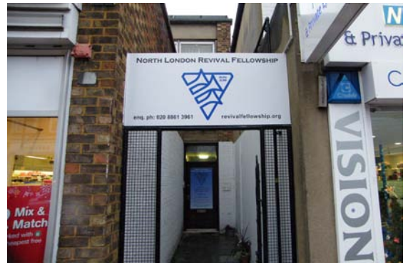
The sign of the North London hall faces directly onto a busy high street