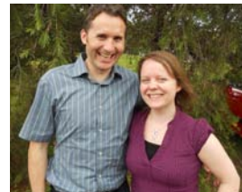
Even visitors from Ireland!