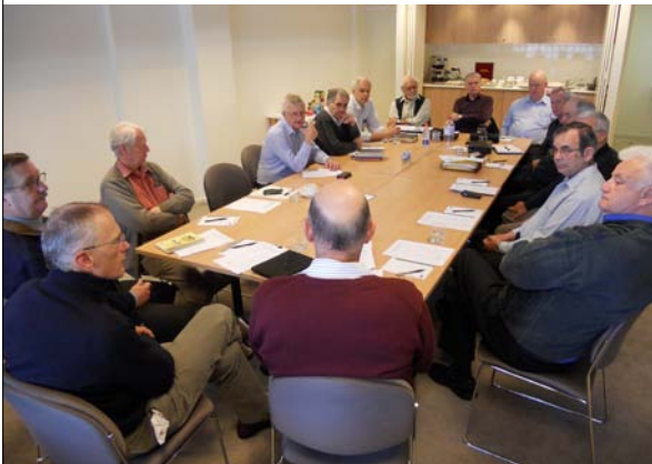
The Victorian and Tasmanian Pastors' Meeting