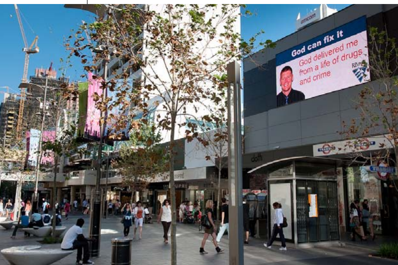
Central Perth video advertisement