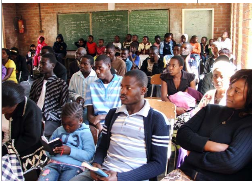
Recent Sunday meeting in Zimbabwe