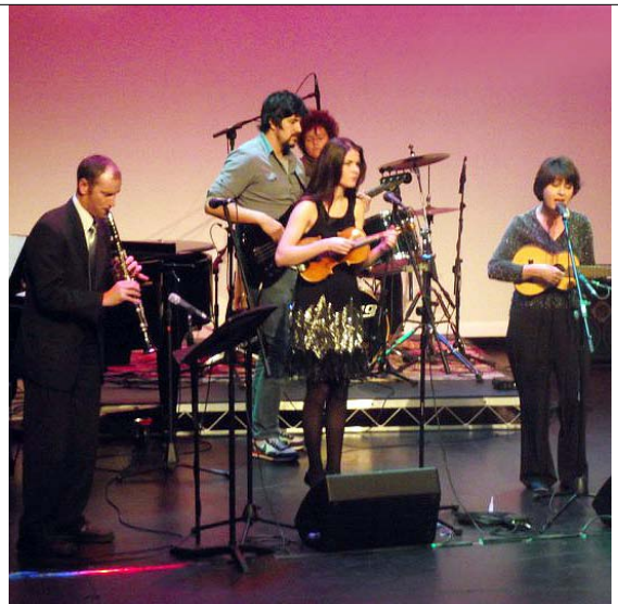
The Sydney band performing

We believe the Bible identifies modern nations and gives signs of the imminent return of Jesus Christ.