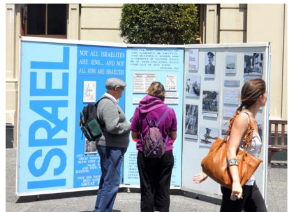
Passers-by in Fremantle chat about Bible prophecy

Most of the outreaching was done around the port City of Fremantle, where the Sunday meetings were conducted at the well-known Esplanade Hotel ballroom. "We had prophecy boards set out in the mall for several days, manned by our faithful evangelist types. And we also tried a new idea: the monster seven metre video continuous advertising screen in central Perth. This is viewed