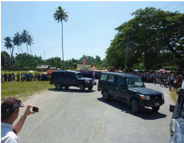
Thousands arrive from around PNG for the National Rally