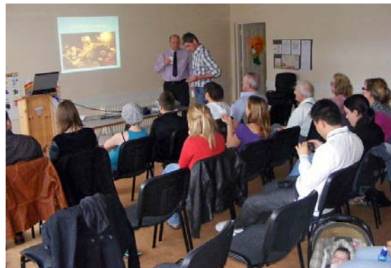
A presentation about to get underway in Ireland

There is great potential for revival in Ireland and the future is very exciting for this committed group of saints. Hopefully similar outreaches can be undertaken in the future. The hospitality, love and care of the Irish brethren was a wonderful blessing and we all made lifelong friends—which of course we’ll carry on through into eternity. They are a very keen bunch of saints.”