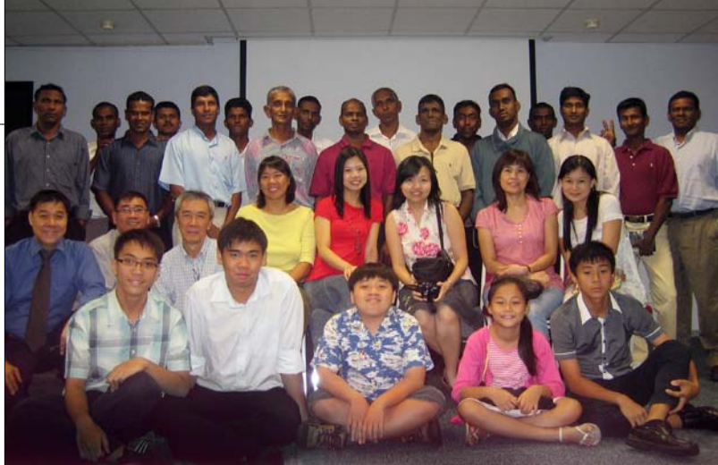
The saints in Kuala Lumpur

We were able to make many good contacts for follow up. The Irish people are very open and