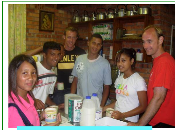
New Year's Eve fun in the kitchen