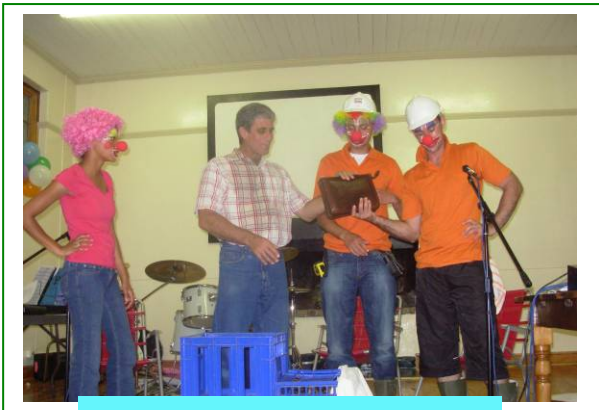
The Crazy Builders skit – "allow us to construct a new rostrum"