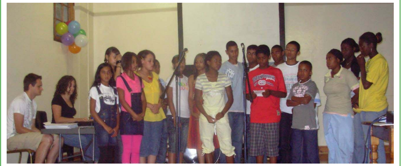
Young People's Item

we can't rest on our laurels. We're looking for more revival in 2008, and today we rejoiced to see our first baptism for the year."