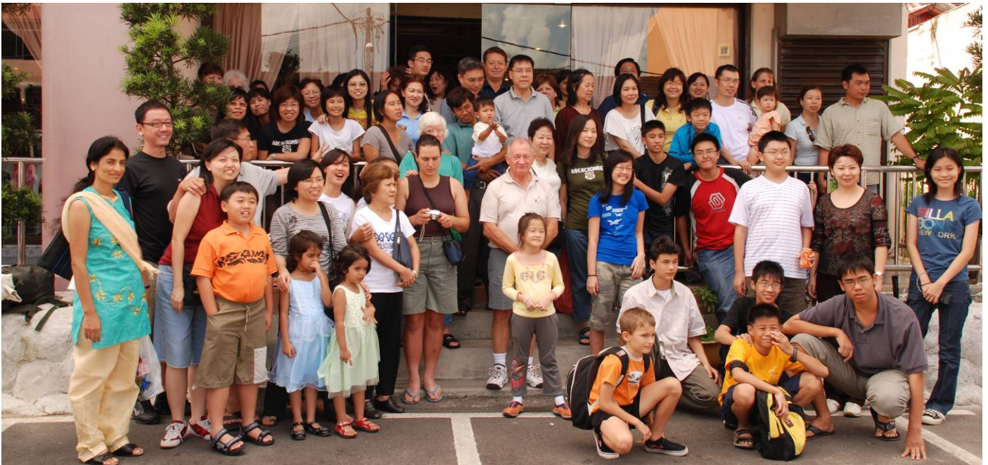
Saints from Singapore, Bali, Hong Kong, Australia, etc.

The Singapore assembly held their camp at the end of November at Kota Tinggi resort just across the border in Malaysia. This year they had over 130 in camp.