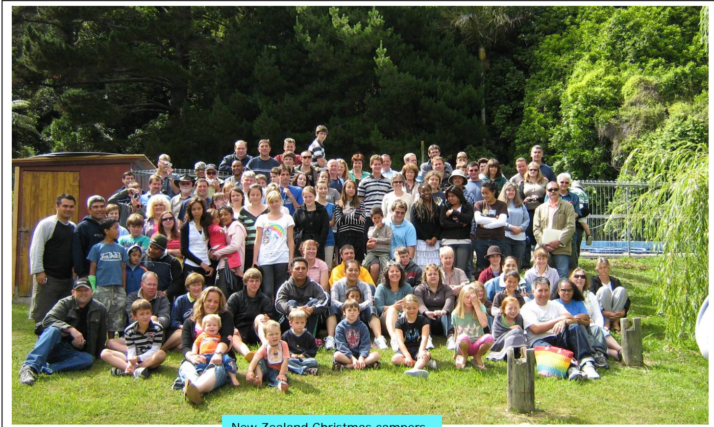
New Zealand Christmas campers