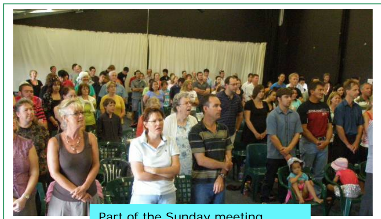
Part of the Sunday meeting

A highlight at camp was the annual Mission Fund Auction night when saints donate all sorts of goods and services. The comperes kept the evening light-hearted and fun - and raised $8 800! We pray this will help our brethren overseas.”