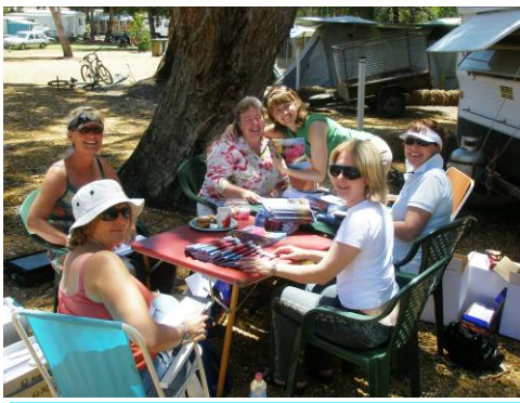
Plenty of time to relax by the Kalgan River