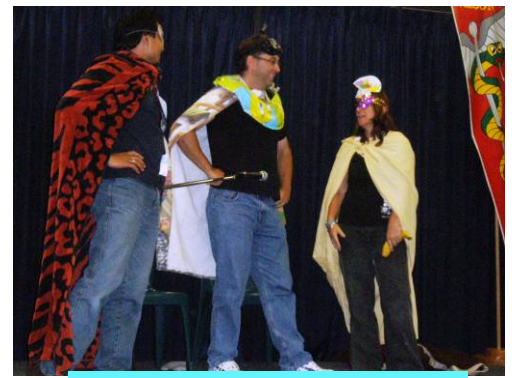
"Fruits-of-the-Spirit Man" (!)