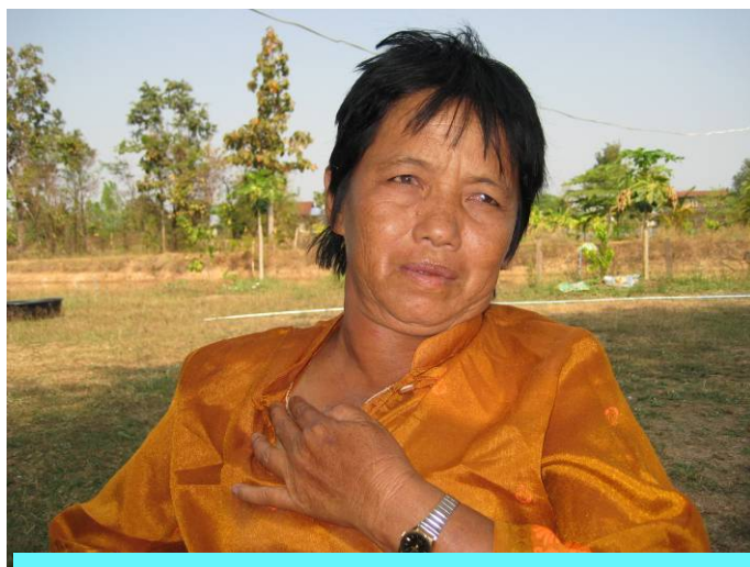
Sister Mek shows where she was healed of a goitre