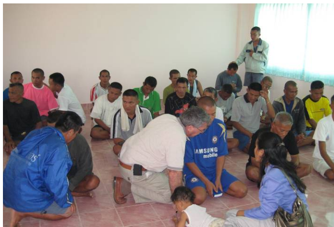
Prisoners seeking to receive the Holy Spirit