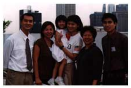
Saints from Hong Kong