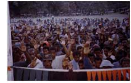
Rabaul Outreach SEPT 03 "Put up your hand if you were healed during the last prayer time!"

There have now been some 20 confirmed AIDS healings